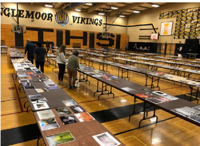
WSHSPC is the largest event of its kind in the U.S.